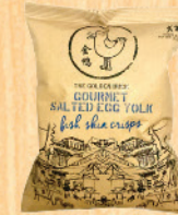
金鴨鹹蛋魚皮 Golden Duck Salt Egg Yolk Fish Skin 塩卵きみ漬け魚の皮 골든덕 절인노른자 생선칩 HKD 35