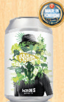
英雄啤酒 美式IPA hEROES Beer Co Cereusly IPA アメリカンスタイ ルIPA 아이피에이 HKD 55