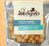
Joe & Seph's 海鹽焦糖爆谷 Joe & Seph's Salted Caramel Gourmet Popcorn Snack Pack 塩キャラメルポップコーン 소금 캐러멜 팝콘 HKD 35