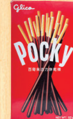
固力果百奇朱古力 Pocky Chocolate ポッキー 포키 (베베로) HKD 25