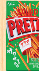
固力果沙律百力滋 Pretz Salad Flavour ブリッツ (サラダ味) 프렛즈 샐러드맛 HKD 25