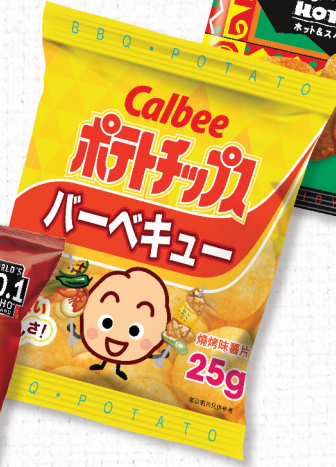
卡樂B燒烤味薯片 Calbee BBQ Flavoured Potato Chips HKD15