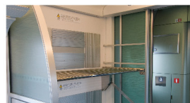
行李存放處 Baggage storage