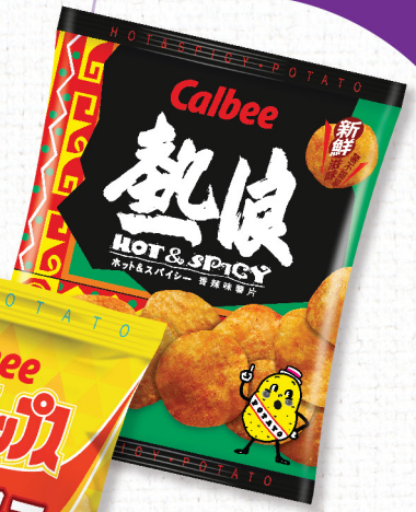
卡樂B熱浪薯片 Calbee Hot And Spicy Flavoured Potato Chips HKD15