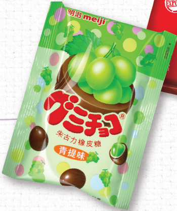
明治青提味朱古力橡皮糖 Meiji Muscat Gummy Chocolate HKD15