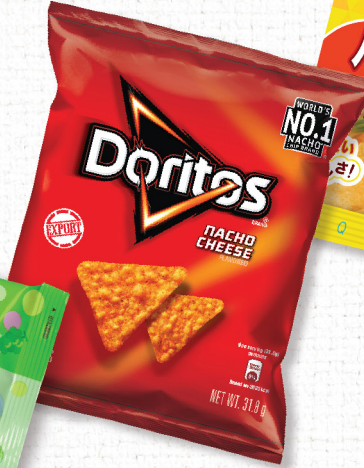
多樂脆芝士味粟米片 Doritos Tortilla Chips Nacho Cheese Flavoured HKD15