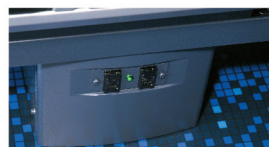
轉插器 AC adaptor